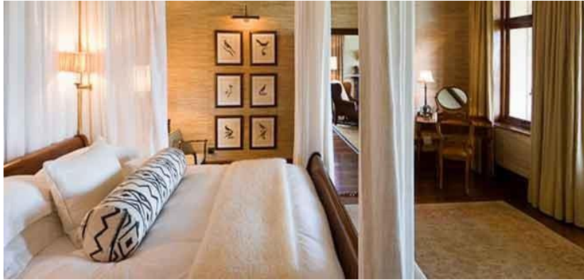
Sasakwa Lodge 1 Bedroom Cottage Meals: Breakfast, Lunch & Dinner