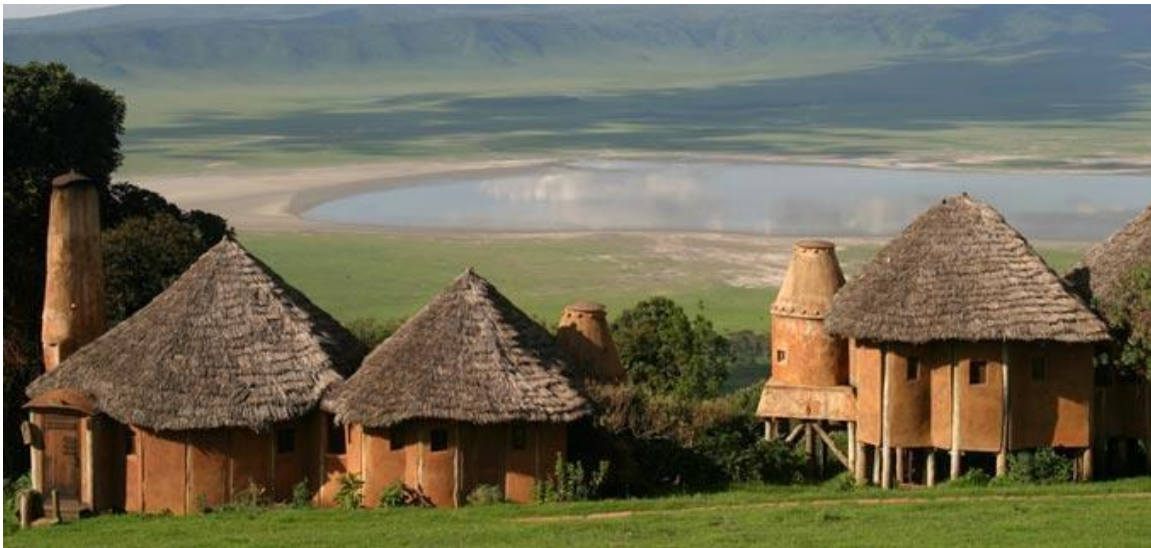
Ngorongoro Crater Lodge, Suite - FB Meals: Breakfast, Lunch & Dinner

The dramatic contrasts within the lodge render it truly striking; stately gold, silver and ruby tones bounce off beaded chandeliers which hang from mud banana leaf ceilings and grass thatched roofs. If the unique 'Maasai meets Versailles' interior does not serve to impress, the almighty view of the crater seen from floor to ceiling windows is certain to leave you awe-struck.